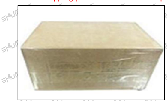
Pic No. 1 Domestic express packaging: Wrapped by Transparent tape

Minors are prohibited from using transparent tape, yellow tape, black wrapping protective film, and white wrapping protective film to avoid personal injury.