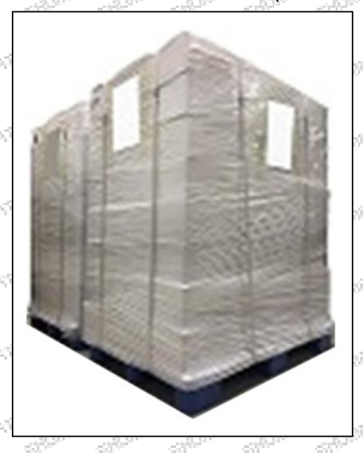
Pic No. 3

Pallet Shipping: Use pallet that meet export requirements, and use white wrapping protective film to wrap and bind with cable ties