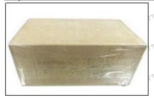
Pic No. 1 Domestic express packaging: Wrapped by Transparent tape