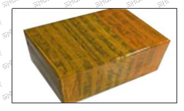
International express packaging: Wrapped with yellow tape after wrapping black protective film

Mob/Whatsapp: +86 13410541523 Tel: +8675523215133