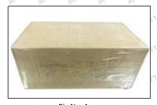
Pic No. 1 Domestic express packaging: Wrapped by Transparent tape

A Minors are prohibited from using transparent tape, yellow tape, black wrapping protective film, and white wrapping protective film to avoid personal injury.