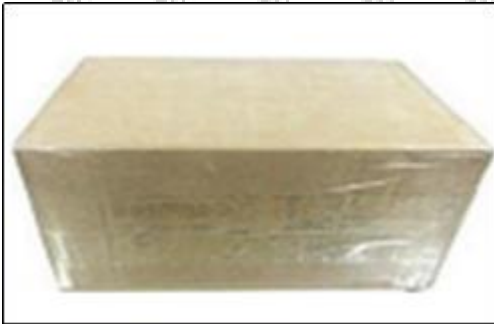
Pic No. 2

⚠ Minors are prohibited from using transparent tape, yellow tape, black wrapping protective film, and white wrapping protective film to avoid personal injury.