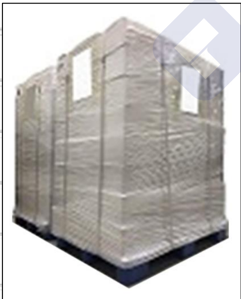
Pic No. 3

International express packaging: Wrapped with yellow tape after wrapping black protective film