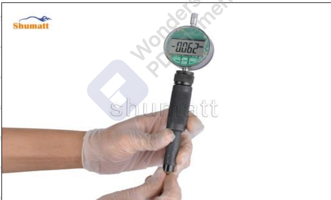
Pic No. 2