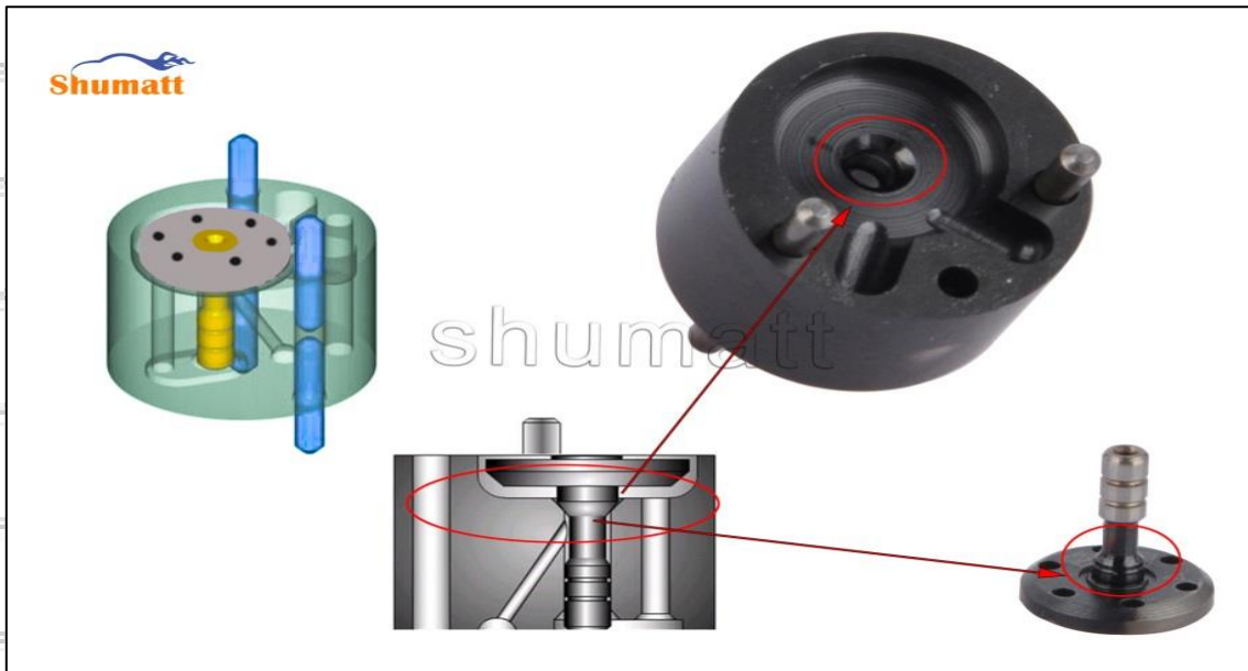
Pic No. 1