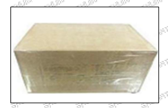
Pic No. 1 Domestic express packaging: Wrapped with Transparent tape

Minors are prohibited from using transparent tape, yellow tape, black wrapping protective film, and white wrapping protective film to avoid injury.