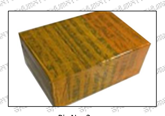
Pic No. 2 International express packaging: Wrapped with yellow tape after wrapping black protective film