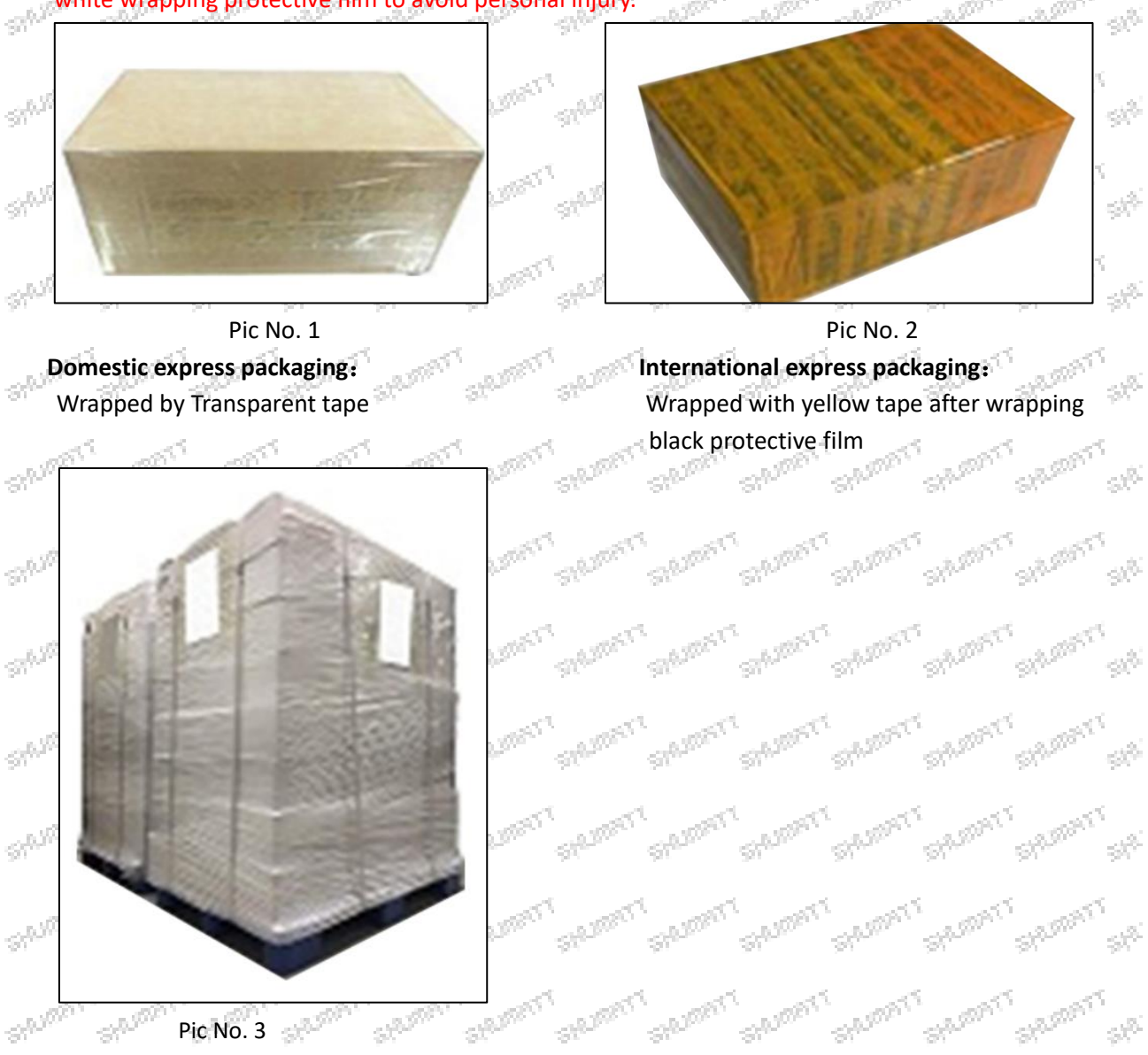
Pallet Shipping: Use pallet that meet export requirements, and use white wrapping protective film to wrap and bind with cable ties