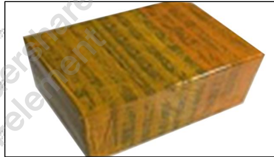
Pic No. 2

Domestic express packaging: Wrapped by Transparent tape