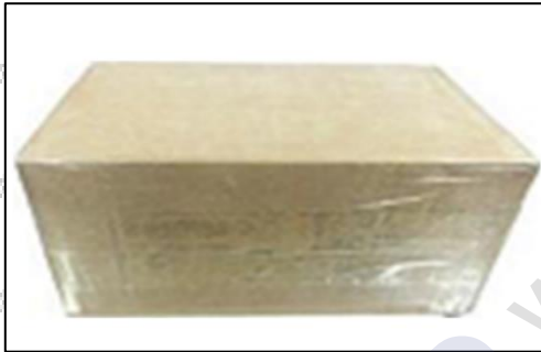
Pic No. 1

▲ Minors are prohibited from using transparent tape, yellow tape, black wrapping protective film, and white wrapping protective film to avoid personal injury.