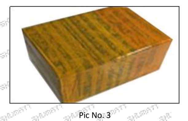
International express packaging: Wrapped with yellow tape after wrapping black protective film