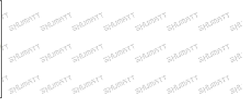
Pic No. 2