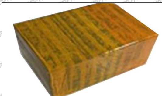
Pic No. 2