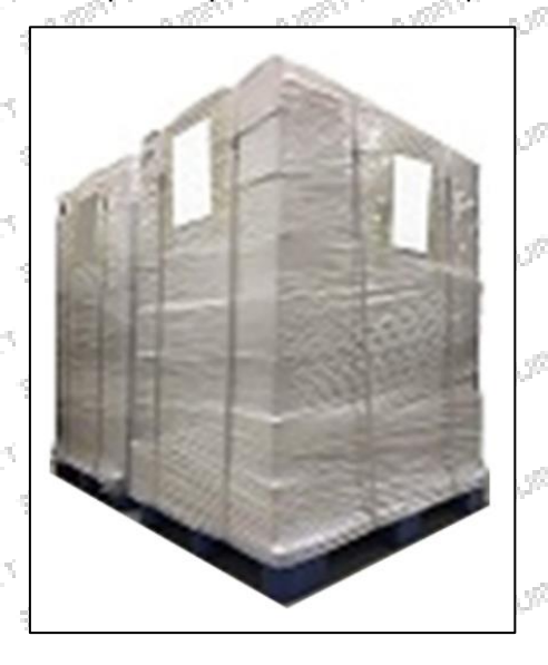
Pallet shipment: Use pallets that meet export requirements and wrap with white plastic wrap and tie.