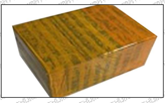
Pic No. 2 International express packaging: Wrapped with yellow tape after wrapping black protective film