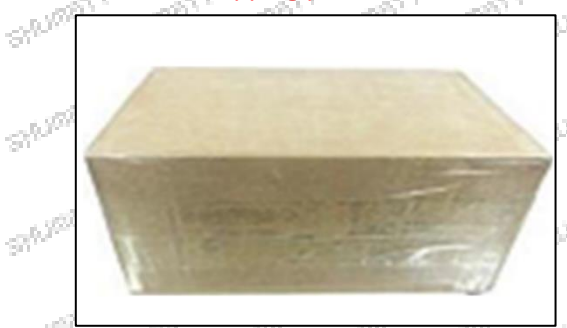
Pic No. 1 Domestic express packaging: Wrapped with Transparent tape