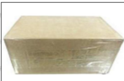
Pic No. 1

⚠ Minors are prohibited from using transparent tape, yellow tape, black wrapping protective film, and white wrapping protective film to avoid personal injury.